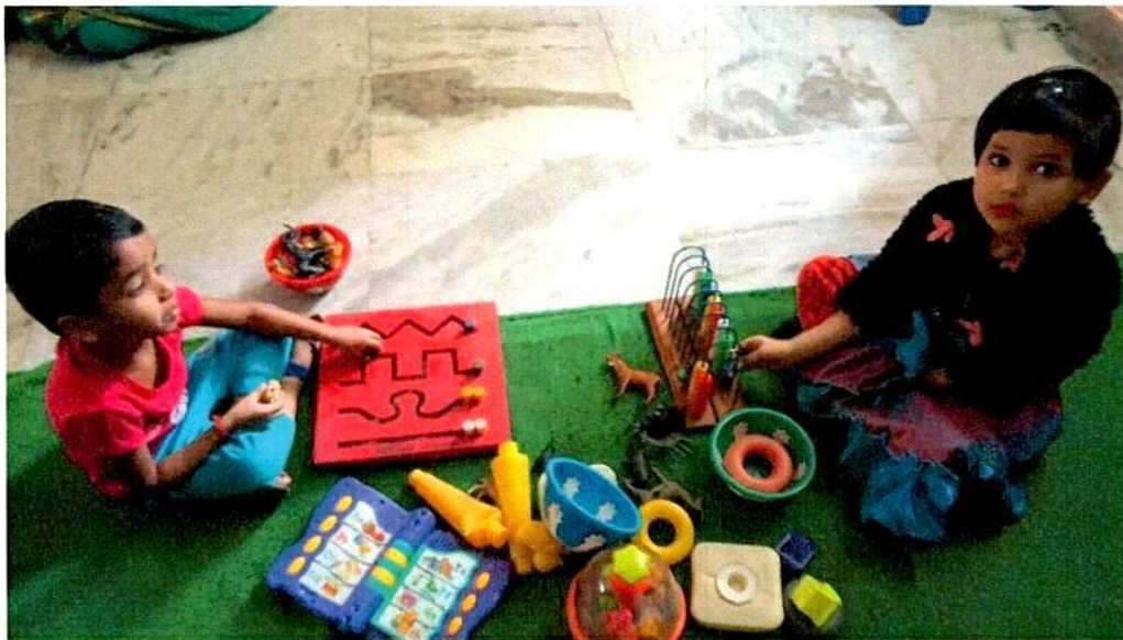
Baby care center at BRIL to take care of Faculty children

The newly married employee, who has young child unable to continue their job due to caring person not available at home, BRIL provides day care centre for employee young children's and provides toys and games under supervision of a care taker and attender.