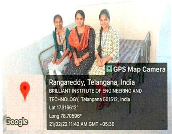
A common room for girls