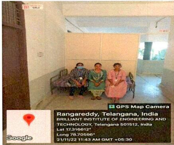
Girls Waiting Hall

Principal PRINCIPAL BRILLIANT INSTITUTE OF ENGINEERING AND TECHNOLOGY Vij. & Mdr. Abdullapurmet, R.R. Dist-501505